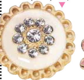
$10, Laila Rowe (LailaRowe.com, style #64591).