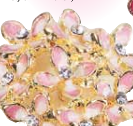
$56, Eve's Addiction (EvesAddiction.com, style #ERZ10457).

Everyone will think they're cushion-cut tanzanites!