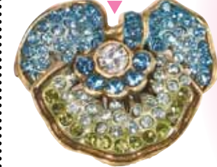
$9, Alltherageonline (Alltherageonline.com, style name "crystal ivory studs").