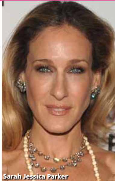
Sarah Jessica Parker

Oblong face shapes should bypass dangly earrings that draw the eye downward. Instead, go for button styles, which visually "lift" the face!