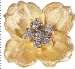
$59, Sweet Romance (SweetRomanceOnline.com, style #E908 in blue).