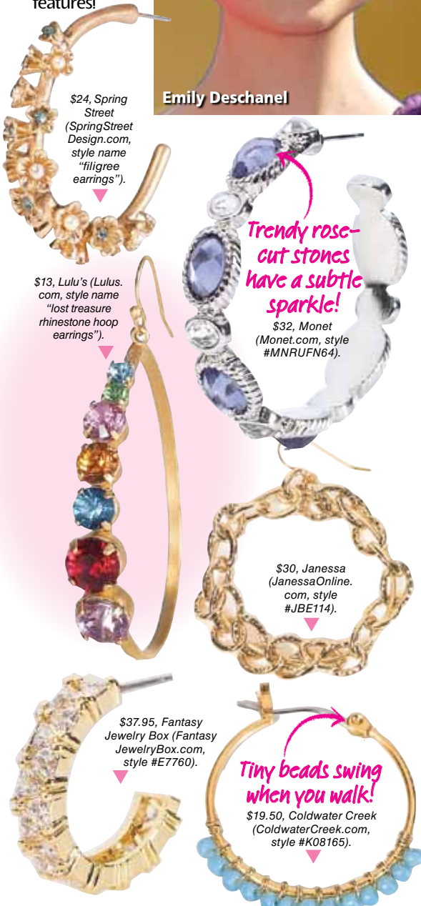
$24, Spring Street Design.com, style name "filigree earrings").

Trendy rose-cut stones have a subtle sparkle!