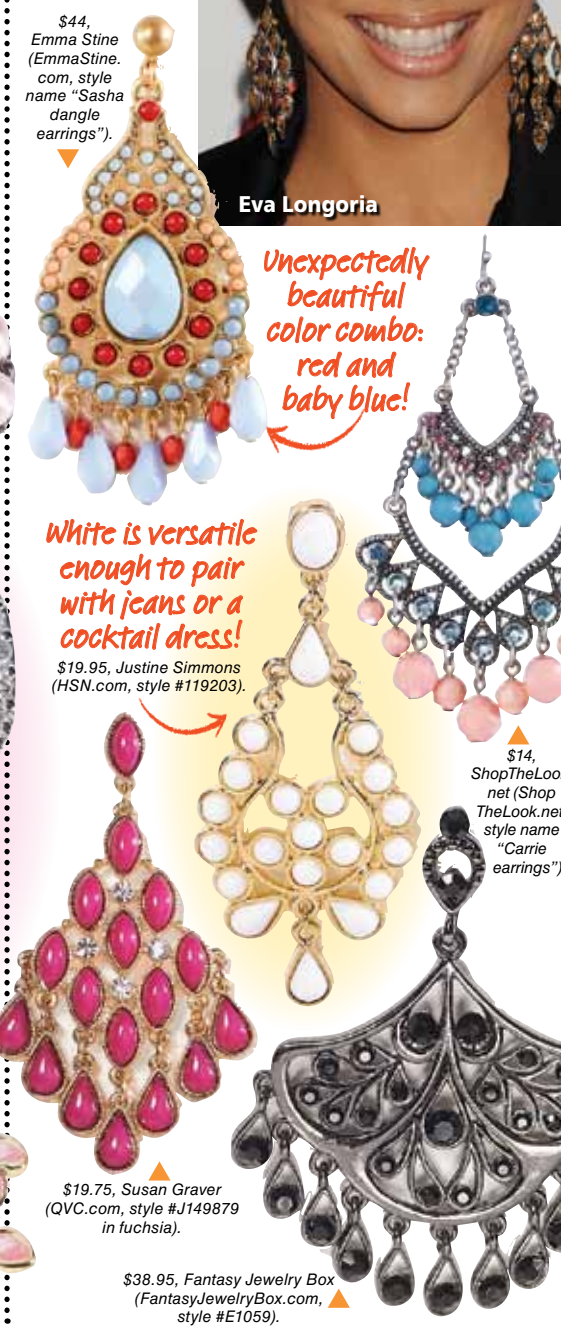
$44, Emma Stine (EmmaStine.com, style name "Sasha dangle earrings").

Unexpectedly beautiful color combo: red and baby blue!