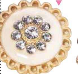
$10, Laila Rowe (LailaRowe.com, style #64591).