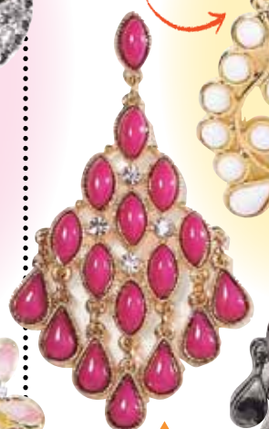
$19.75, Susan Graver (QVC.com, style #J149879 in fuchsia).