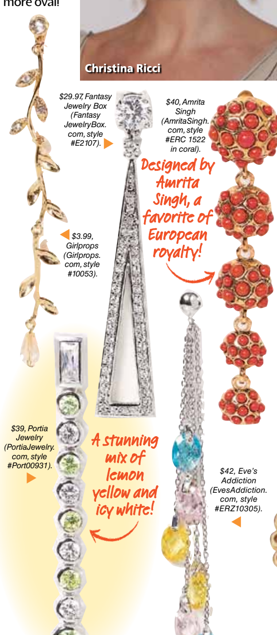
$29.97, Fantasy Jewelry Box (FantasyJewelryBox.com, style #E2107).