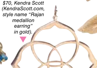
$70, Kendra Scott (KendraScott.com, style name "Rajan medallion earring" in gold).