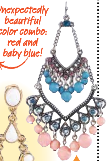
$14, ShopTheLook.net (ShopTheLook.net, style name "Carrie earrings").