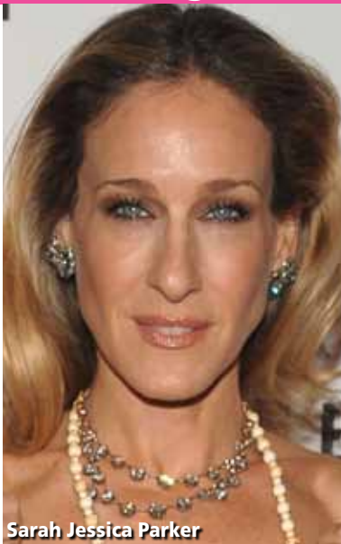
Sarah Jessica Parker

Oblong face shapes should bypass dangly earrings that draw the eye downward. Instead, go for button styles, which visually "lift" the face!