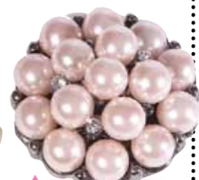
$25, Guess (Zappos.com, style #7745725).