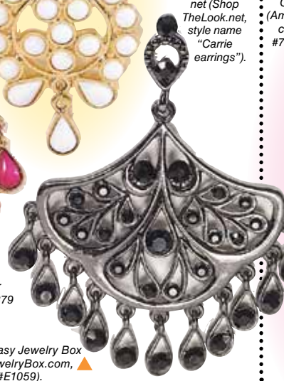
$38.95, Fantasy Jewelry Box (FantasyJewelryBox.com, style #E1059).