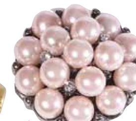
$25, Guess (Zappos.com, style #7745725).