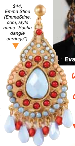
$44, Emma Stine (EmmaStine.com, style name "Sasha dangle earrings").

Unexpectedly beautiful color combo: red and baby blue!