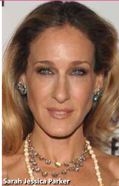
Sarah Jessica Parker

Oblong face shapes should bypass dangly earrings that draw the eye downward. Instead, go for button styles, which visually "lift" the face!