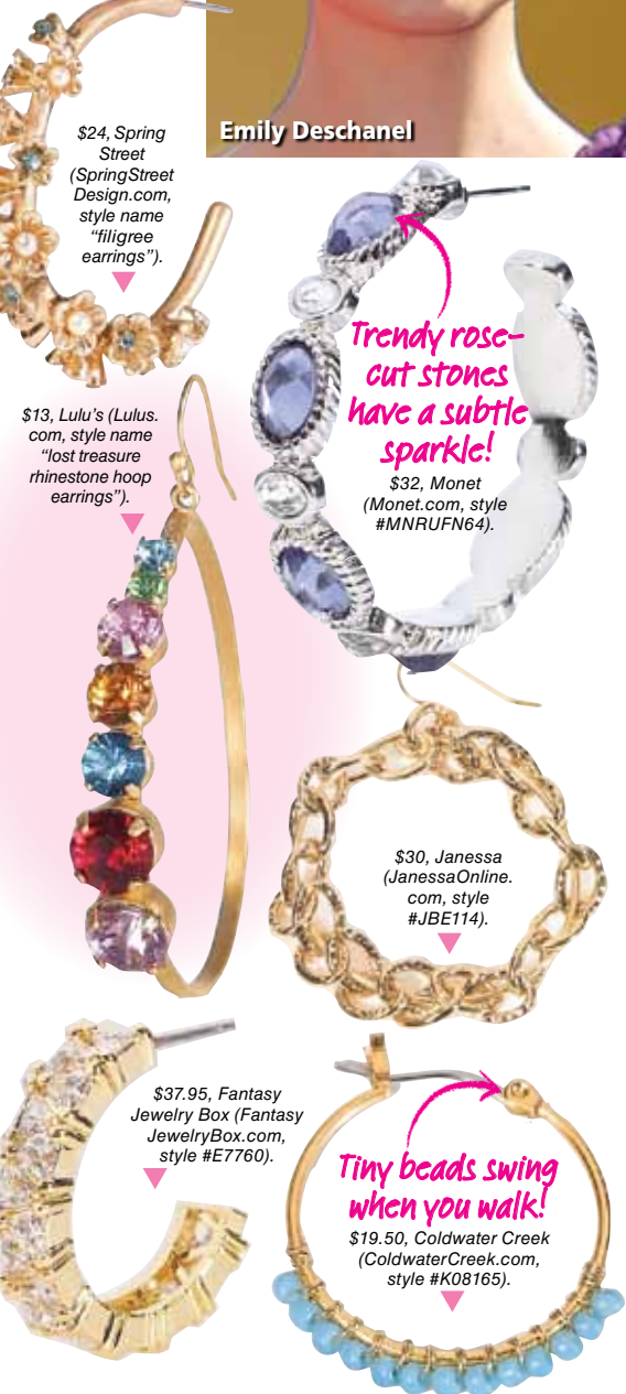
$24, Spring Street Design.com, style name "filigree earrings").