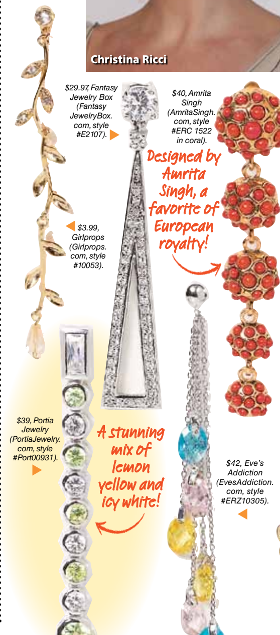
$29.97 Fantasy Jewelry Box (FantasyJewelryBox.com, style #E2107).